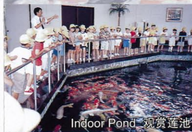
Indoor Pond 观赏莲池

从资料展示是可以看到从鲤鱼的最初产生，到现在的变迁，以及品种，绸缎鲤鱼的魅力，饲养方法等英文说明。同时随时可以通过录相或品评会等形式观赏。