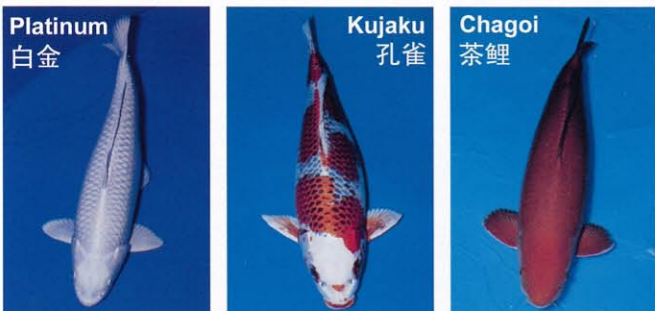
Platinum 白金 A Koi with brilliant white metallic luster. 肤色像白金一样发光的品种。 Kujaku 孔雀 A metallic Goshiki. Yellow or golden pattern on a Matsuba base, meaning "peacock". 拥有五色光泽，仿佛是孔雀的翅膀。 Chagoi 茶鲤 A single colored, brown or greenish Koi, often with prominent scale reticulation. 基本色是棕色或覆盖绿色的网结横样的鱼鳞的鲤鱼。