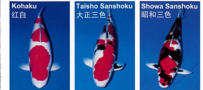
Kohaku 紅白 A Koi with a red pattern on a white background originating from the Asagi. The most popular Koi. 在白色的肌肤上有红色的斑纹装饰的品种，是由浅黄而变化的锦鲤，也是最基本的锦鲤。 Taisho Sanshoku 大正三色 Red and black markings on a white background and no black markings on the face. 白色的肌肤上有红色的纹样和黑色的斑点，在头部没有黑色斑点。 Showa Sanshoku 昭和三色 Red and white markings on a black background. Normally has Sumi on the face and at the base of the pectoral fins. 黑色肌肤上有红白模样的装饰，头部和胸鳍顶端有墨色。

It is said that there are more than 80 varieties of Nishikigoi. Here are 18 representative varieties.