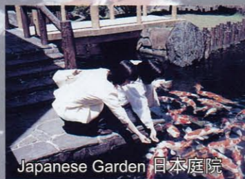
Japanese Garden 日本庭院

There are four garden ponds and two waterfalls in the garden. Visitors' eyes can be amused by the consigned koi in the ponds and flowers of the season.