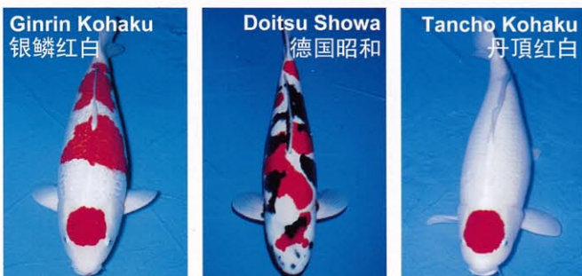
Ginrin Kohaku 银鳞红白 A Kohaku with glittering scales like a brilliant diamond. 拥有光泽的鱼鳞的紅白。 Doitsu Showa 德国昭和 A Showa without scales derived from crossing Showa and Doitsugoi. 昭和和德国鲤鱼交配的品种。 Tancho Kohaku 丹頂紅白 A white Koi with only one circular red marking on the head. 头部有圆形红色纹样的鲤鱼。