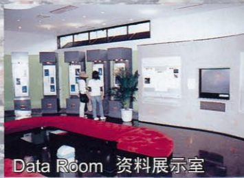
Data Room 资料展示室

Here you can find the explanation of the origin of Nishikigoi, details about the process of improvement from Wagoi to Nishikigoi, information on identifying the numerous type of Nishikigoi and describing their various charms, and information on breeding skills is provided in both Japanese and English. A video on cultivation and on koi shows can also be seen here.