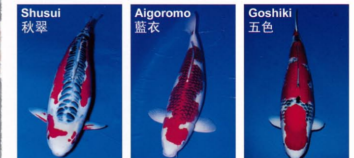
Shusui 秋翠 The Doitsugoi (no scales) version of Asagi, with normally a row of large, dark scales on the back and sides. 德国鲤鱼（没有鱼鳞或只有背上及两侧有鱼鳞的鲤鱼）与浅黄交配的品种。 Aigoromo 藍衣 A red pattern on a white background with an indigo-blue reticulation in the red. 白色的背景上有红色模样的，在红色纹样上有蓝色的鲤鱼。 Goshiki 五色 A Kohaku-like red pattern on a background of Asagi. 浅黄的皮肤上有红白纹样的鲤鱼。