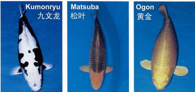
Kumonryu 九文龙 A black Doitsugoi with white markings. Black pattern changes with the season. 在黑色的皮肤长有白色斑纹鼓起的德国鲤鱼，样子随着季节的变化而变化。 Matsuba 松叶 A red or yellow Koi with dark pinecone-like pattern on the scales. 红色或者黄色的皮肤上有黑色的松叶花纹。 Ogon 黄金 A Koi with a brilliant golden metallic luster. 全身都是黄色的有光彩的品种。