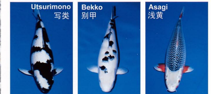
Utsurimono 写类 Shiro Utsuri is a black Koi with white patches, Hi Utsuri (black and red), Ki Utsuri (black and yellow). 黑色的肌肤上有白色，红色，黄色模样的白写，缋写，黄写。 Bekko 别甲 Shiro Bekko is a white Koi with black spots, Aka Bekko (red and black), Ki Bekko (yellow and black). 白色，红色，黄色皮肤上有黑色的斑点，形成白色别甲，红色别甲，黄色别甲。 Asagi 浅黄 An indigo-blue Koi with a red belly and pectoral fins, and a light blue reticulation pattern. 青色的皮肤上镶嵌有天蓝色鱼鳞，腹鳍和胸鳍有红色鱼鳞的美丽的品种。