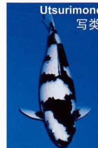
Utsurimono 写类 Shiro Utsuri is a black Koi with white patches, Hi Utsuri (black and red), Ki Utsuri (black and yellow). 黑色的肌肤上有白色，红色，黄色模样的白写，绯写，黄写。