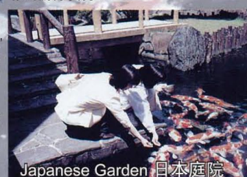
Japanese Garden 日本庭院

庭院由4个莲池和2个瀑布构成从4月中旬到11月物主保管的鲤鱼畅游伴随各季节盛开的花朵构成美上加美的风景。