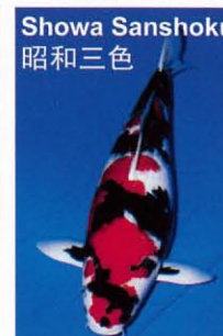
Showa Sanshoku 昭和三色 Red and white markings on a black background. Normally has Sumi on the face and at the base of the pectoral fins. 黑色肌肤上有红白模样的装饰，头部和胸鳍顶端有墨色。