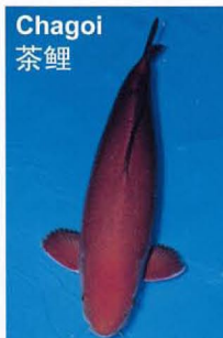
Chagoi 茶鲤 A single colored, brown or greenish Koi, often with prominent scale reticulation. 基本色是棕色或覆盖绿色的网结模样的鱼鳞的鲤鱼。