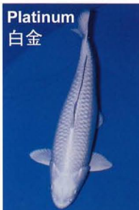
Platinum 白金 A Koi with brilliant white metallic luster. 肤色像铂金一样发光的品种。