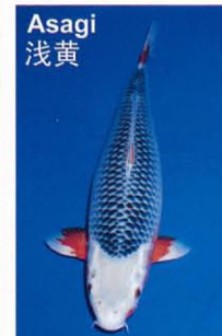
Asagi 浅黄 A indigo-blue Koi with a red belly and pectoral fins, and a light blue reticulation pattern. 青色的皮肤上镶嵌有天蓝色鱼鳞，腹鳍和胸鳍上有红色鱼鳞的美丽的品种。