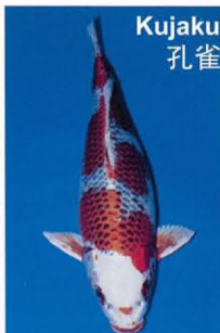
Kujaku 孔雀 A metallic Goshiki. Yellow or golden pattern on a Matsuba base, meaning "peacock". 拥有五色光泽，仿佛是孔雀的翅膀。