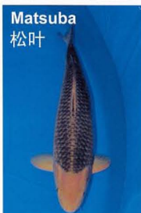
Matsuba 松叶 A red or yellow Koi with dark pinecone-like pattern on the scales. 红色或者黄色的皮肤上有黑色的松叶花纹。