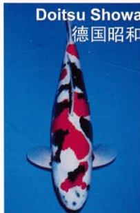
Doitsu Showa 德国昭和 A Showa without scales derived from crossing Showa and Doitsugoi. 昭和 and 德国鲤鱼交配的品种。