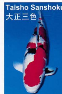
Taisho Sanshoku 大正三色 Red and black markings on a white background and no black markings on the face. 白色的肌肤上有红色的纹样和黑色的斑点，在头部没有黑色斑点。