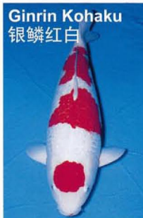
Ginrin Kohaku 银鳞红白 A Kohaku with glittering scales like a brilliant diamond. 拥有光泽的鱼鳞的红白。