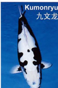
Kumonryu 九文龙 A black Doitsugoi with white markings. Black pattern changes with the season. 在黑色的皮肤长有白色斑纹鼓起的德国鲤鱼，样子随着季节的变化而变化。