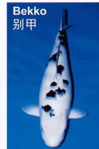
Bekko 别甲 Shiro Bekko is a white Koi with black spots, Aka Bekko (red and black), Ki Bekko (yellow and black). 白色，红色，黄色皮肤上有黑色的斑点，形成白色别甲，红色别甲，黄色别甲。