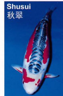
Shusui 秋翠 The Doitsugoi (no scales) version of Asagi, with normally a row of large, dark scales on the back and sides. 德国鲤鱼（没有鱼鳞或只有背上及两侧有鱼鳞的鲤鱼）与浅黄交配的品种。