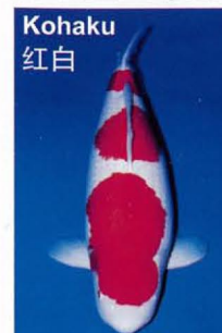
Kohaku 红白 A Koi with a red pattern on a white background originating from the Asagi. The most popular Koi. 在白色的肌肤上有红色的斑纹装饰的品种，是由浅黄而变化的锦鲤，也是最基本的锦鲤。

It is said that there are more than 80 varieties of Nishikigoi. Here are 18 representative varieties.