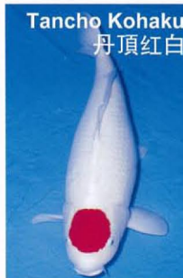
Tancho Kohaku 丹顶红白 A white Koi with only one circular red marking on the head. 头部有圆形红色纹样的鲤鱼。