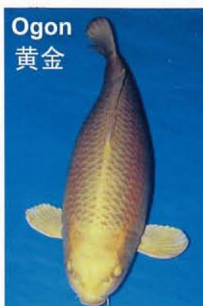
Ogon 黄金 A Koi with a brilliant golden metallic luster. 全身都是黄色的有光彩的品种。